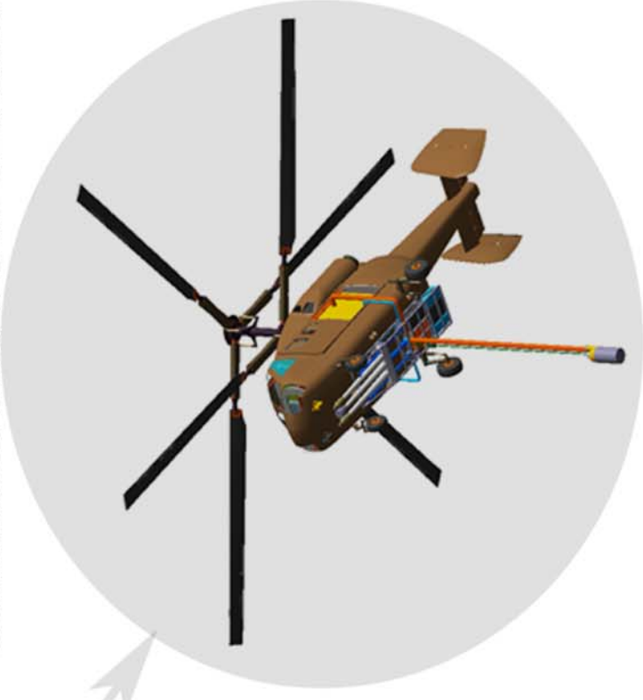
Self Contained Firefighting Module